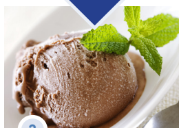
3 Ice cream