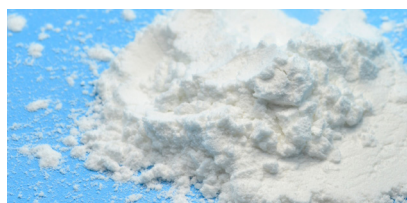
MS FL raw