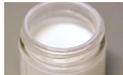
SS HR raw