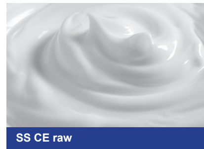
SS CE raw