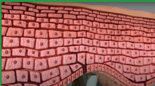
Epidermis – Keratinocytes

Epin'Derm restores the health of the surface layer of the skin, through a soothing and protective process.