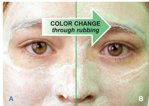
Figure 3: Facial mask with White to Green SalColorsFx™ technology showing pre-color change (A) and post-color change (B).